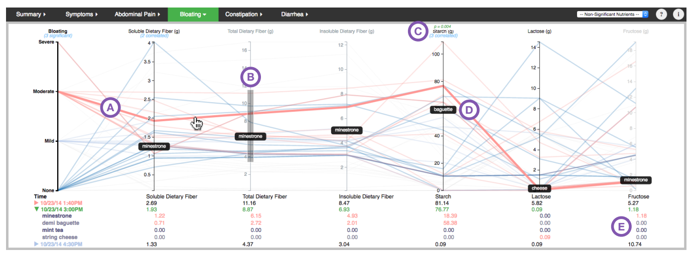
Figure 2: (A) A line corresponds to a single meal in the patient's journal. (B) The user can specify a filter on a variable to only view meals within that range. (C) The axis title shows additional information above (the p value on hover) and below (the number of correlated nutrients). Clicking the number of correlated nutrients expands the visualization to include those nutrients. (D) Hovering over a line fades the other lines out and shows annotations of the food in that meal highest in each nutrient, at the appropriate position on the axis for that food and nutrient. (E) The foods and nutrient values for the hovered line are expanded in the food table below the visualization. The other meals correspond to ones within the current filter.