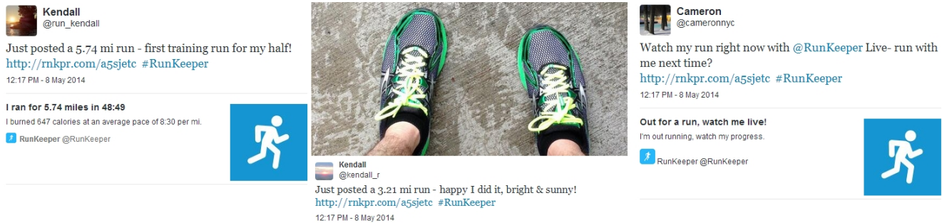
Figure 1. Tweets generated for the GT study varied on several dimensions, allowing us to separately evaluate the role of each of these features.

generated content. Of the tweets that included user-generated text, 22.0% contained positive or negative emotion. We also observed tweets containing descriptions of the weather, asking for advice or support, and additional information such as heart rate or run intervals. 299 runners added pictures in their tweets, which were typically landscapes, pictures of their shoes, or selfies.